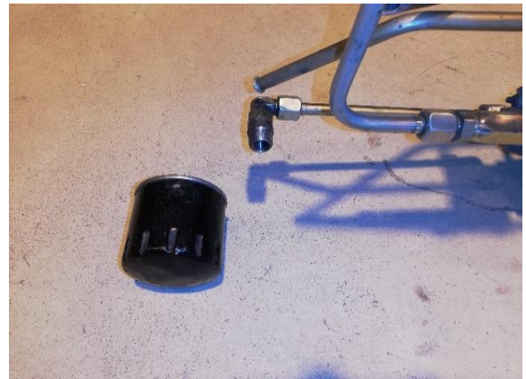
Picture 2 Remove the old filter and leave the nut on the pipe as shown on the right picture above