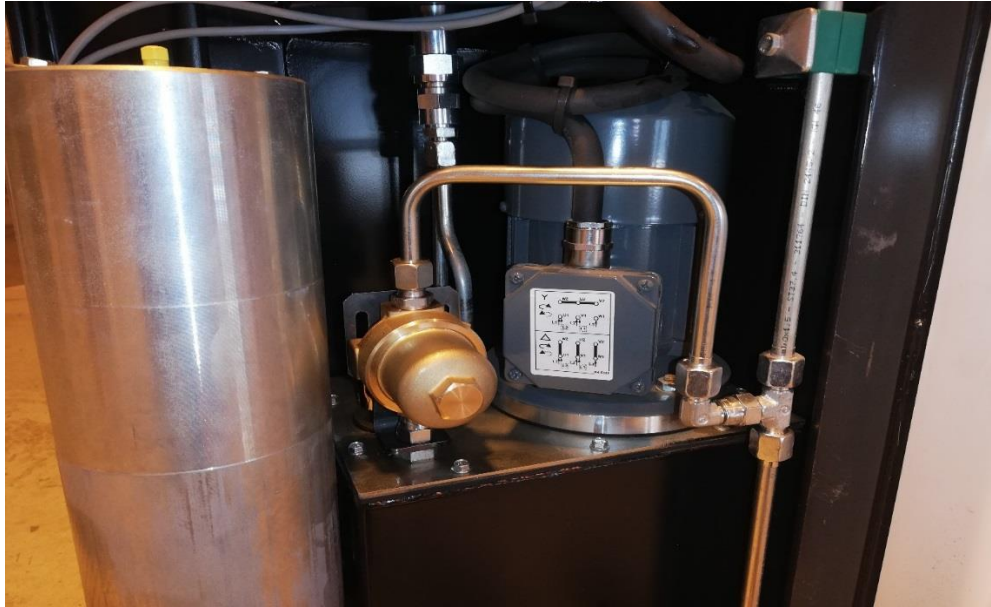
Picture 4 Example of modified filter solution with new tubing arrangement