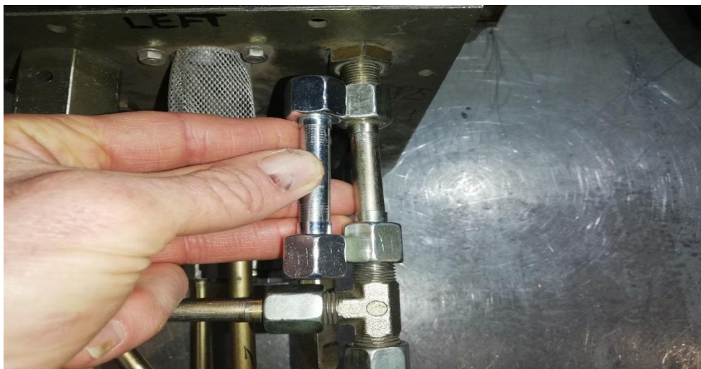
Picture 3 When fitting the new filter bracket to the bulkhead union, the pipe inside oil tank need to be replaced with slightly longer pipe